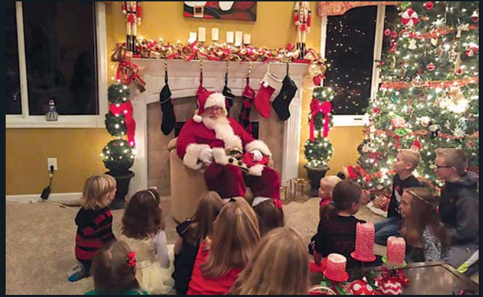
▲ More than 245 children in Northern Kentucky received gifts. Children visited with Santa before receiving gifts.

Support Center associates donated gifts in December 2022 to Christmas Angels, an organization focused on giving hope to children who may be in a situation where they feel hopeless. Thanks to the generous support of our associates and other community partners, more than 245 children across Kenton, Boone, Campbell and Grant counties experienced the joy of the holidays. Christmas Angels has served 1,744 children and families to date. 🌟