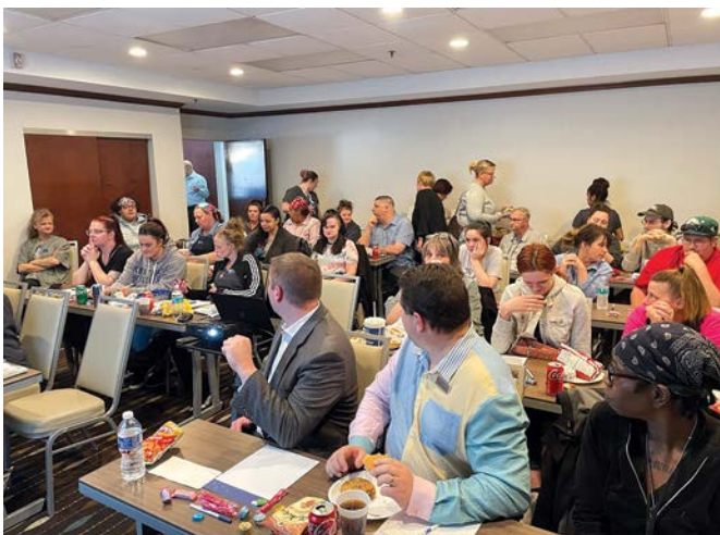
▲ Associates attend training to assist them in providing guests with the very best service.

HOLIDAY INN EXPRESS & SUITES CINCINNATI RIVERFRONT hosted the first of three regional service training sessions. Associates will continue learning and developing guest relation skills when future sessions are held at Springhill Suites Cincinnati/Midtown and Hampton Inn & Suites Cincinnati Airport South .