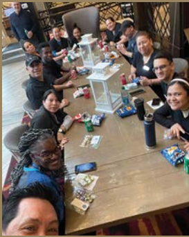
▲ Hotel Indigo Atlanta Vinings enjoyed a staff lunch from Chick-fil-A.

The EMBASSY SUITES BY HILTON AKRON CANTON team got creative in the kitchen with a demo from their chef. The leadership team then raised a glass in honor of a well-deserved property award. 🍷