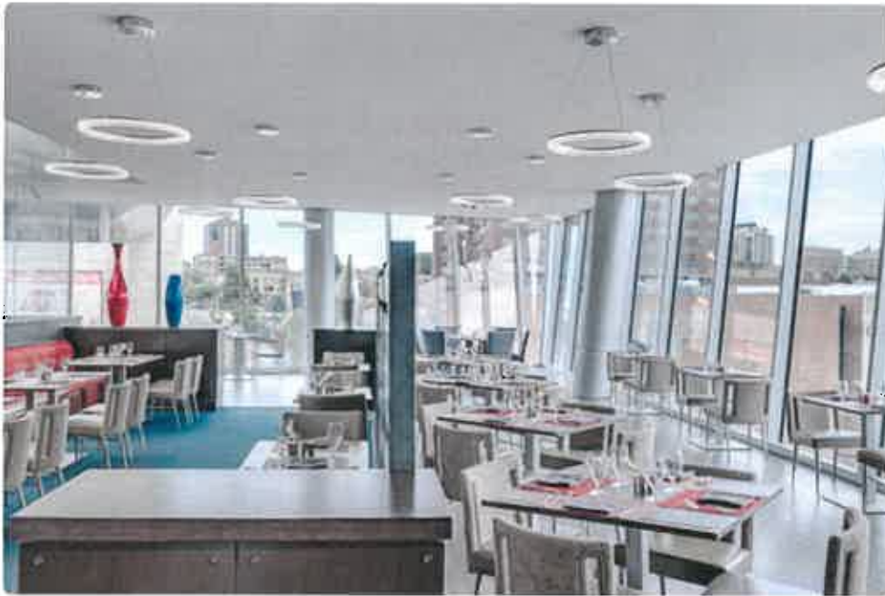
Fire's dining room