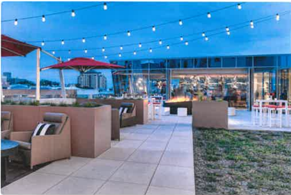
Fire's outdoor garden terrace